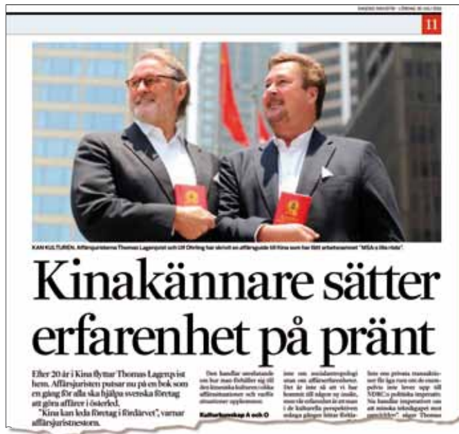
Swedish daily business newspaper Dagens Industri, 30 July 2011.

The book is scheduled to be released in October and has been written in English.